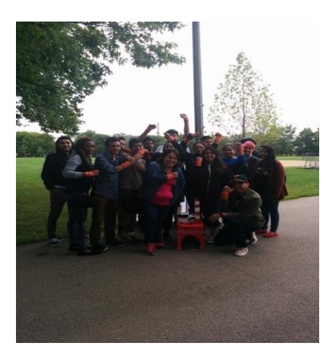
LVEJO Youth Leaders