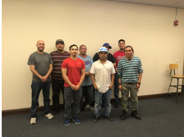
LVEJO 2018 Solar for All Trainees.

After careful deliberation, the selection committee narrowed down the top 35 candidates for the 2018 cohort. LVEJO was able to advocate for eight participants to start the solar training program, which began Wednesday, May 9th, 2018.