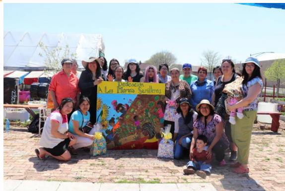
Mother's Day Celebration

National Youth Organizing Training Institute. They worked alongside 70 other participants who came together to share, build skills and strategize to further develop youth organizing in their own communities. They hope to bring all the skills and knowledge they learned back to Little Village youth in this year's summer youth internship!